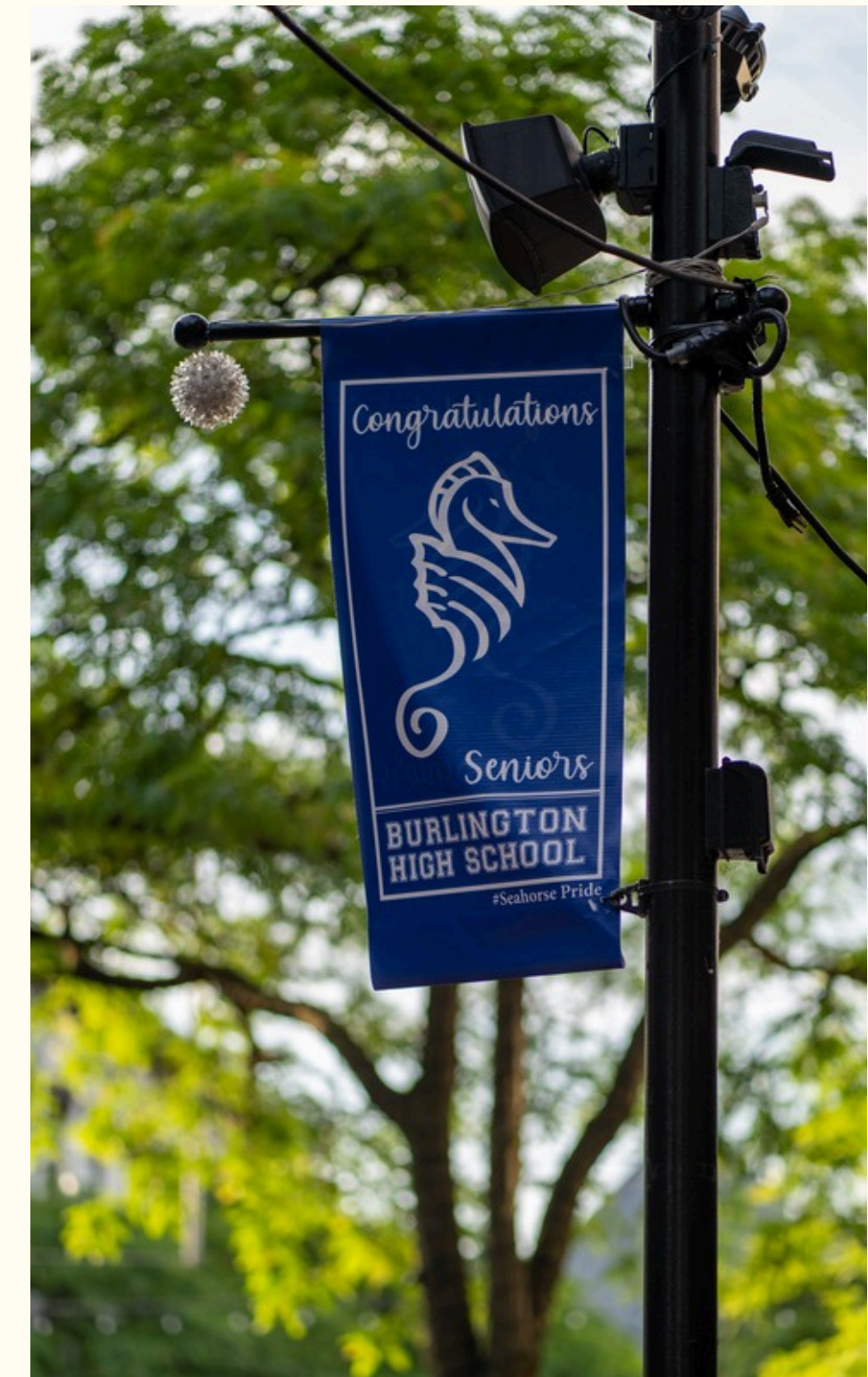
Light Pole Banner